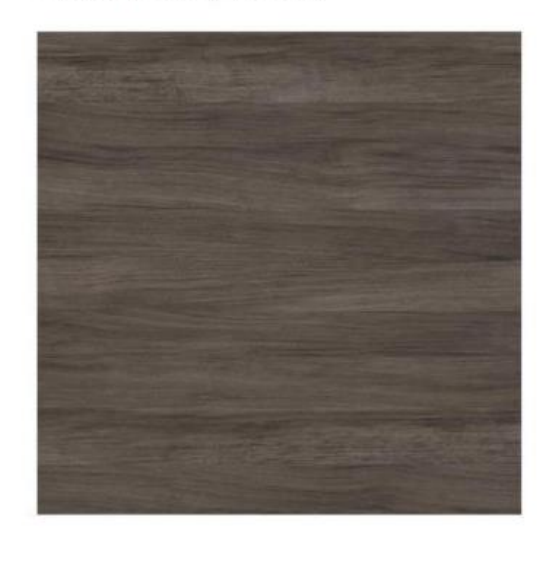
Artisan Grey (AGL)