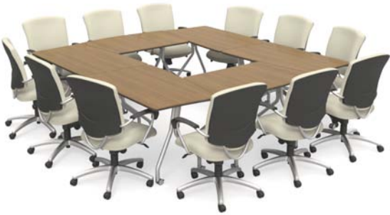
Forum Meeting (seats 12)