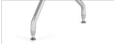
Spider legs with standard leveler glides