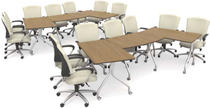
Large Teamed Presentation (seats 14)