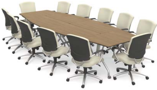
Meeting with Team Leaders (seats 12)

A package of six tables easily adapts to provide quick meeting solutions.