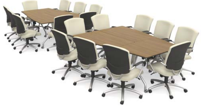
Discussion Groups (seats 18)