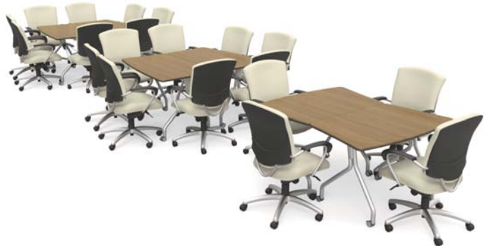
Large Teaming Stations (seats 20)