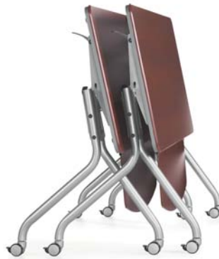
Flip Top Tables incorporate an easy-to-release mechanism that allows the table top to be flipped and "nested" to save space when not in use.