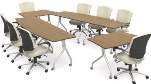
Meeting with Speaker/Moderator (seats 8)