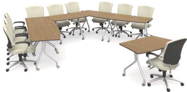
Lecture (seats 10)