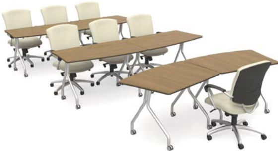
Small Teamed Presentation (seats 7)

When the day is done, Bungee can be nested and put away.