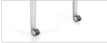
Tapered legs with optional locking casters