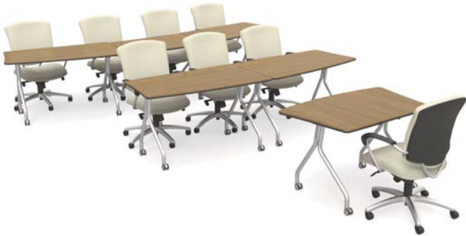
Classroom (seats 8)