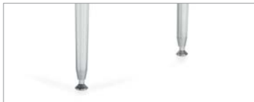
Tapered legs with standard leveler glides