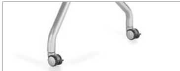
Spider legs with optional locking casters