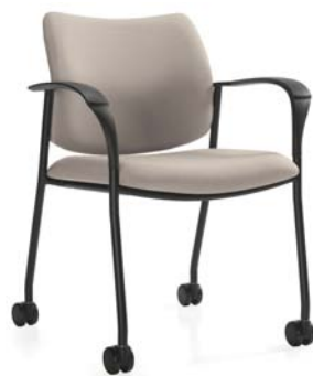
6900C Guest chair with casters shown in Momentum Tate, Helm (09113564) with Black frame (BLK).