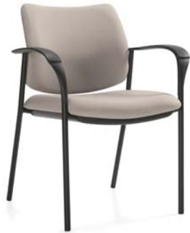
6900 Armchair with upholstered seat shown in Momentum Tate, Helm (09113564) with Black frame (BLK).