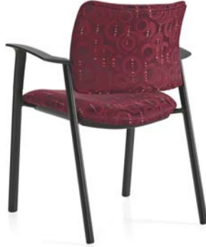
6656 Back View Guest armchair with upholstered back.