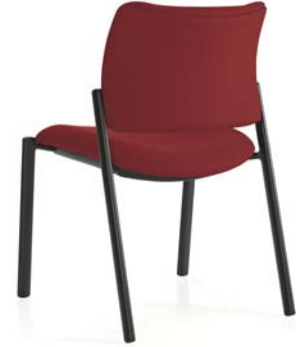
6657 Back View Armless Guest chair with upholstered back.