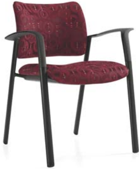
6656 Guest armchair shown in Mayer Disco, Garnet (WC957-001) with Black frame (BLK).