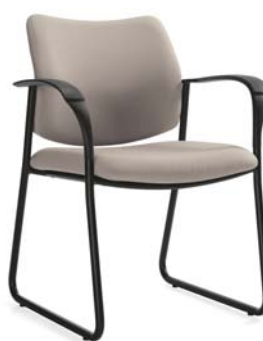
6902 Guest chair with sled base shown in Momentum Tate, Helm (09113564) with Black frame (BLK).