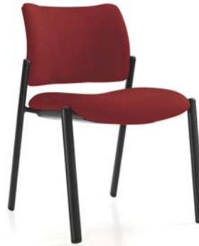
6657 Armless Guest chair shown in Imprint, Candy Apple (IM74) with Black frame (BLK).