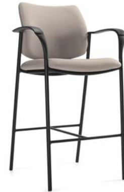
6906 Bar height stools shown in Momentum Tate, Helm (09113564) with Black frame (BLK).