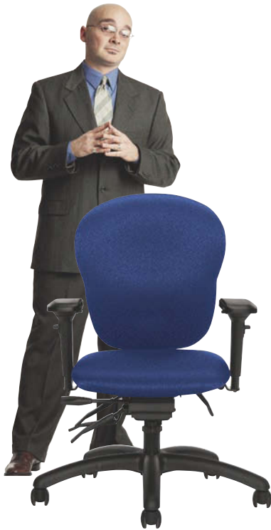
3021-3: Scale 1 Multi-Tilter

In addition to the scaled proportions of this series, each chair has multiple adjustment features that allow a user to customize the fit of the chair for their own body and preferred postures.