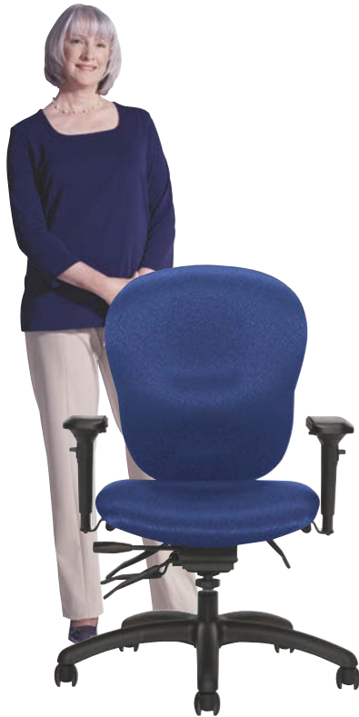
3022-3: Scale 2 Multi-Tilter