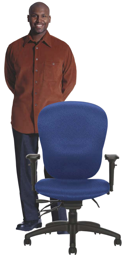
3023-3: Scale 3 Multi-Tilter