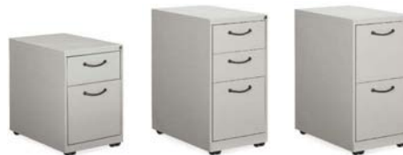
EMP23BF Box and File