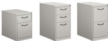
EWP23BF Box and File